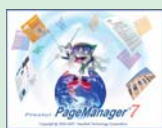
NewSoft Presto! PageManager (Document Management Software)