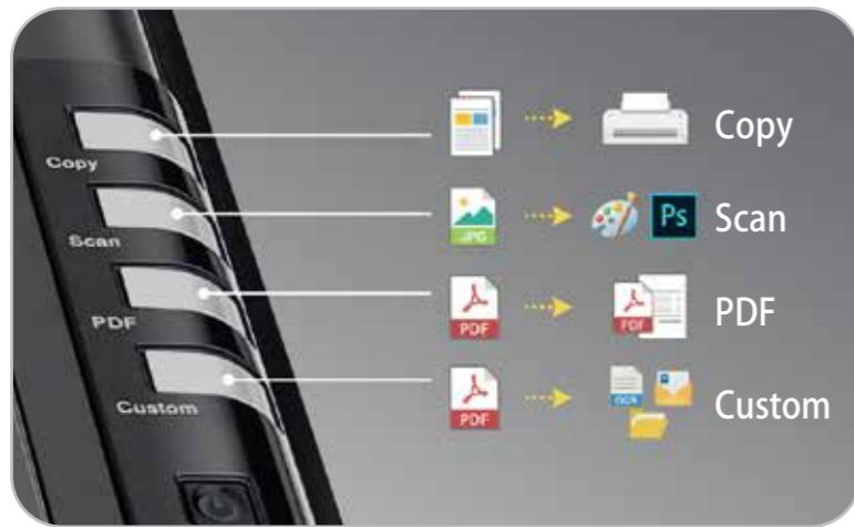
Image Express enables to make quick changes and instant adjustments before exporting your images.